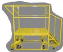
Pelletizer Man Stand